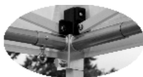
Long Short 3 Way