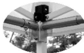
Long Short 3 Way