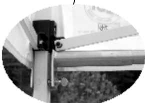
Long StaBar ELL