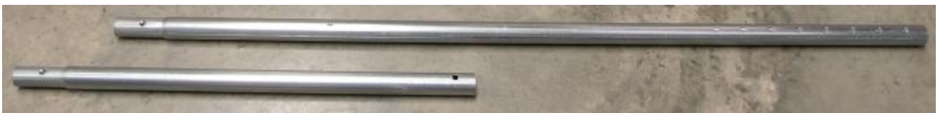
TrimLine Telescoping Leg with 9 ft. Extender pole (measures 27")

For a 9 ft. tall TrimLine, the extender poles measure 27"