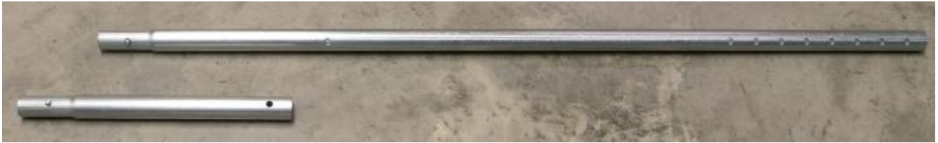
TrimLine Telescoping Leg with 8 ft. Extender pole (measures 15")

To extend the height of your TrimLine you will receive Upper Leg Extension poles, 15" for 8 ft. tall TrimLines or 27" for 9 ft. tall TrimLines.